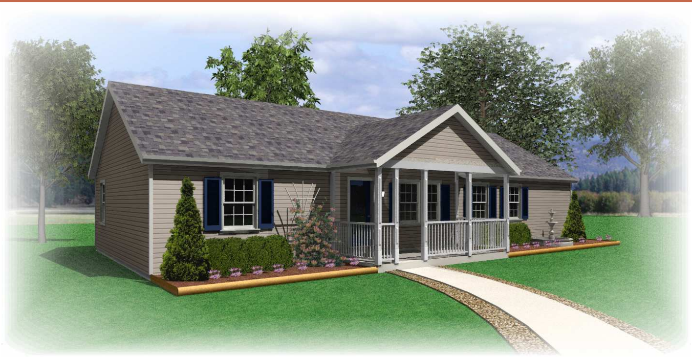
Home renderings are for illustrative purposes only and may contain some optional features; actual homes may vary.